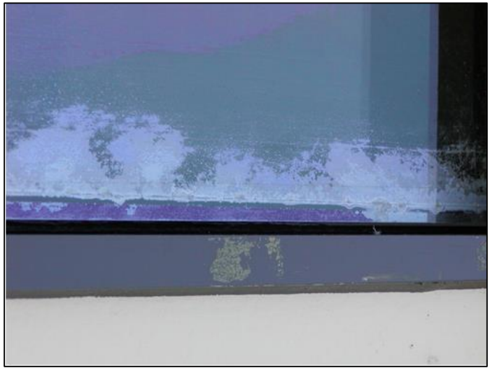
Fig. CG01-2: Coating corrosion due to no edge deletion

Competitive double silver Low-E coatings were tested without edge deletion. These samples were fabricated using a dual seal construction with PIB (polyisobutylene) as the primary seal and silicone as the secondary seal. The samples were exposed to accelerated weathering of 140° F, 100% relative humidity and UV light, a test known in the industry as the P-1 test. This test was chosen because Cardinal IG and some other IG and sealant manufacturers have used it to determine the durability and weatherability of IG unit constructions.