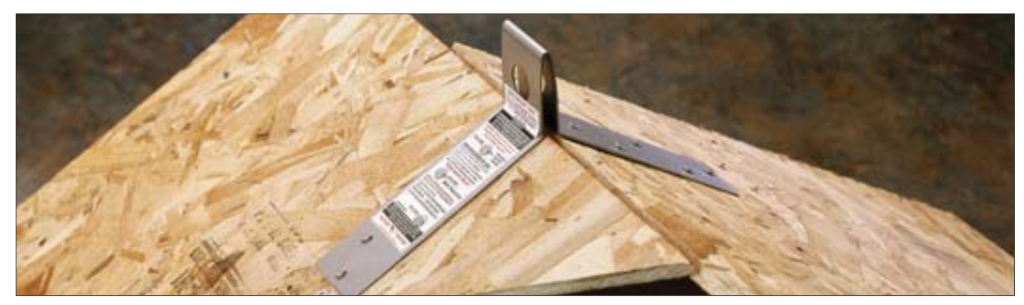
The 3K is installed easily using a hammer and 10 factory supplied nails.

The 3K is a disposable and cost effective device that can be installed with a hammer and nails when a permanent anchor is not available. Used primarily by service trades like roofing material suppliers. The 3-K can also be used to secure a ladder to keep it from falling. Pre-formed to fit a 5/12 pitched roof, the 16 gauge steel anchor is easily adjusted to any degree. To abandon, simply flatten and roof over. Like the 5-K, the attachment hole will accept all standard sized snap hooks and carabiners. Supplied in 12 packs with fasteners.