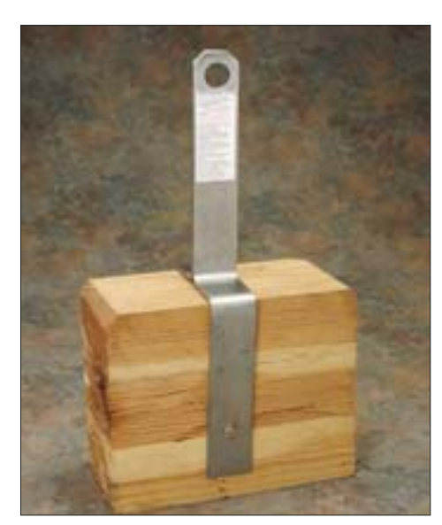
Structural wood beams are commonly specified for drill through attachment.

Custom sized anchors can be fabricated to attach to virtually any type of steel or wood framing member. Designs can be engineered for drilling through or bolting under the supporting member. Common application include Glue-Lam, Micro-Lam and structural wood beams, steel I-beams, steel I-joist, metal web I-joist, and steel trusses. To ensure a waterproof installation, anchor stem heights are designed to be used with metal decking, rigid insulation panels and built up roofing systems providing compatibility with any of our flashing bases and stem covers. Available in cold rolled or 304 stainless steel and supplied with grade 8 attachment bolts.