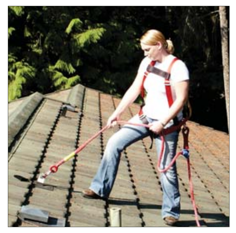
Total Package Deluxe utilizes a 12 strand colored lifeline.