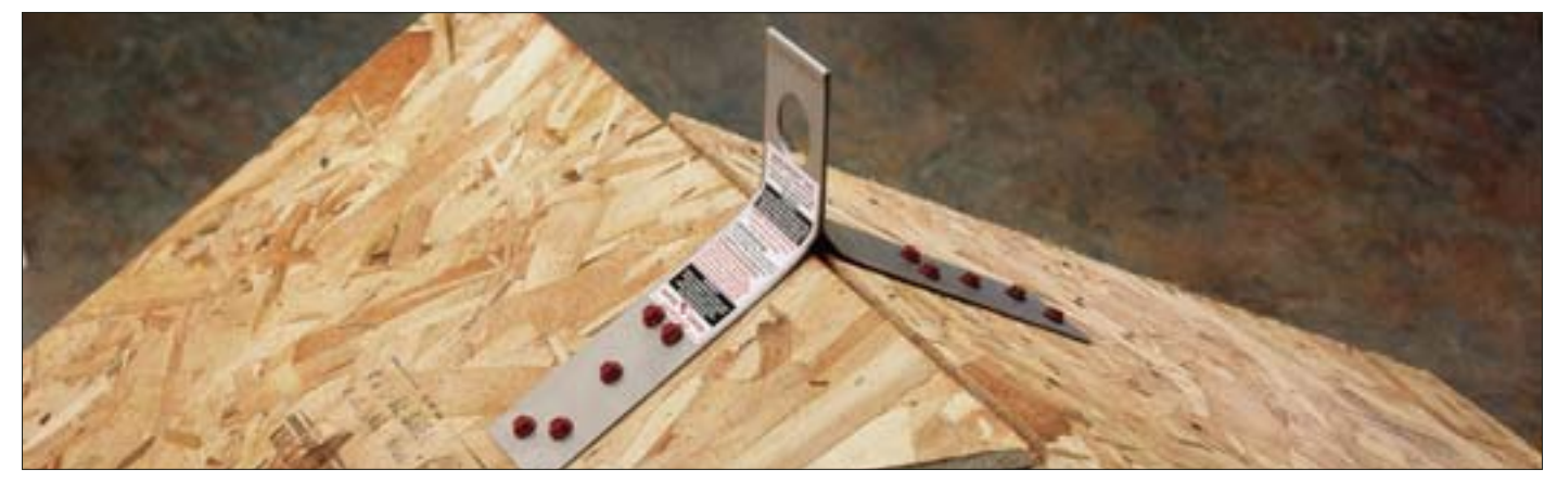
The 5K is rated for 5,000 lbs and is attached using 10 factory supplied hex head screws. Replacement fastener packages are available.

Here is an easy-to-install anchor that can be mounted at the ridge or in the field. The 18 gauge stainless steel 5K is durable enough to be used over and over. Preformed to fit an 8/12 pitch roof, the anchor can also be shaped to any degree, including flat. The 5K feature an attachment hole that allows all standard sized snaphooks and carabiners to be used. Rated for fall arrest.