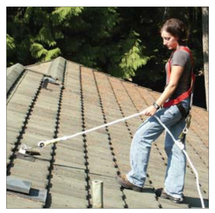
Value-Pak system features a 3 strand lifeline system.