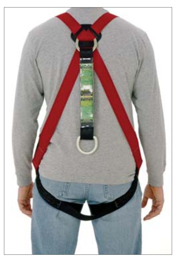
Our #6008 full body harness with integral shock absorber.