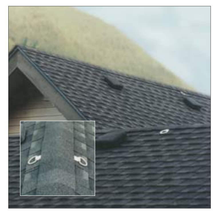
A single retro-fit anchor provides a flashing free anchorage that is accessible from both sides of the ridge. Low visibility can be achieved by painting to match the roof color.