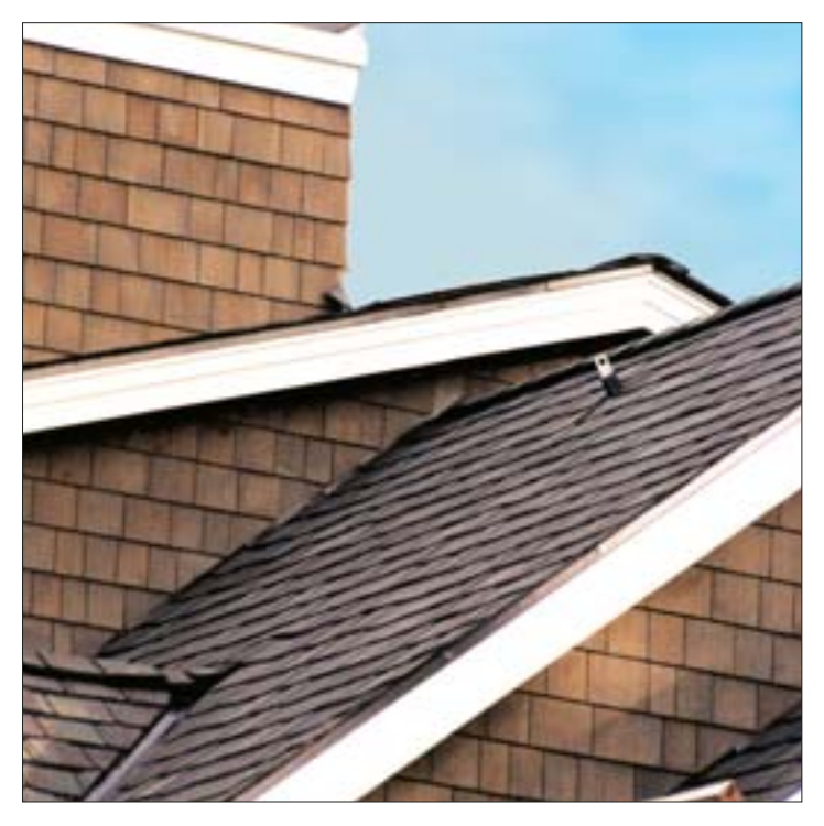
Service and maintenance personnel easily attach to the ARS 2x8 by removing the stem cover. Shown flashed into an asphalt shingle roof with the standard Santoprene base.