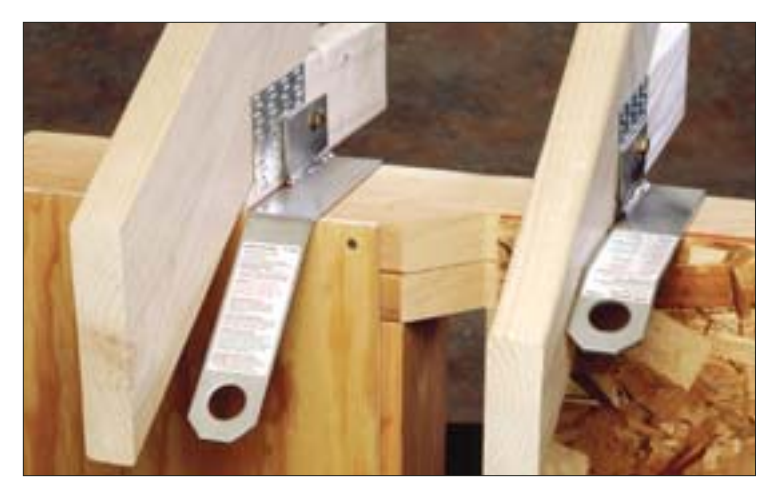
On the left , #1004-A 45° is attached to a 2x6 top plate. On the right , #1004 is attached to a 2x4 top plate shown above low pitched roof.

Siding and related external wall construction, such as window installation and painting, expose workers to an even greater risk than working on elevated surfaces such as the roof. Falls from scaffolding and especially ladders, accounts for more serious injuries than any other job site hazard. Vertical Wall Anchors provide an easy cost effective way to provide protection that can be left in place or removed from service. The low visibility anchor stem comes in two standard configurations allowing a wide range of installation options. Attaches by drilling through the top chord and securing to the wall plate using 4 16d sinkers. The anchor is supplied with all necessary fasteners. Designed to accommodate the bird blocking component on low or steep slopes and fabricated using 1/8" thick stainless steel.