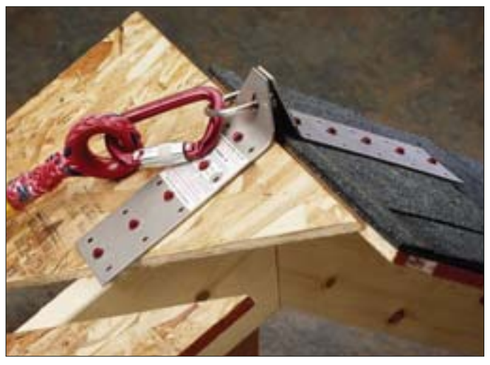
The attachment ring is sized to fit all common size snaphooks and carabiners.