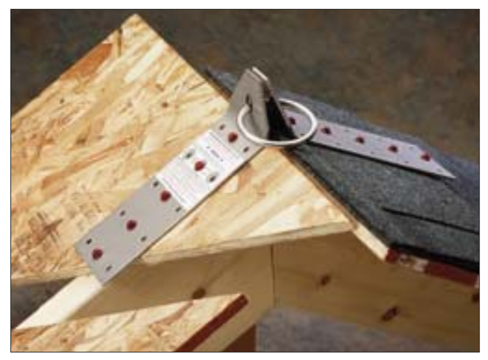
Attached to top chord using factory supplied hex head fasteners.

No other anchor has as many fastening options as the Universal. The Universal Anchor is a heavy-duty, 11 gauge stainless steel surface mounted anchor point. You have your choice of installing the anchor at the peak of the roof (up to a 12/12 pitch) or in the field using our hex head screws or duplex nails. Several different mounting options are made available to the user including: through sheathing into top chord, through sheathing only, or through existing roofing/sheathing. It is 100% component compatible with all of our Fall Arrestor <sup>®</sup> and Total Package <sup>®</sup> systems using either a carabiner or snap-hook attachment. Included with each anchor is a 6 page instruction manual detailing the different mounting options. The Universal Anchor is rated for fall arrest/fall restraint.