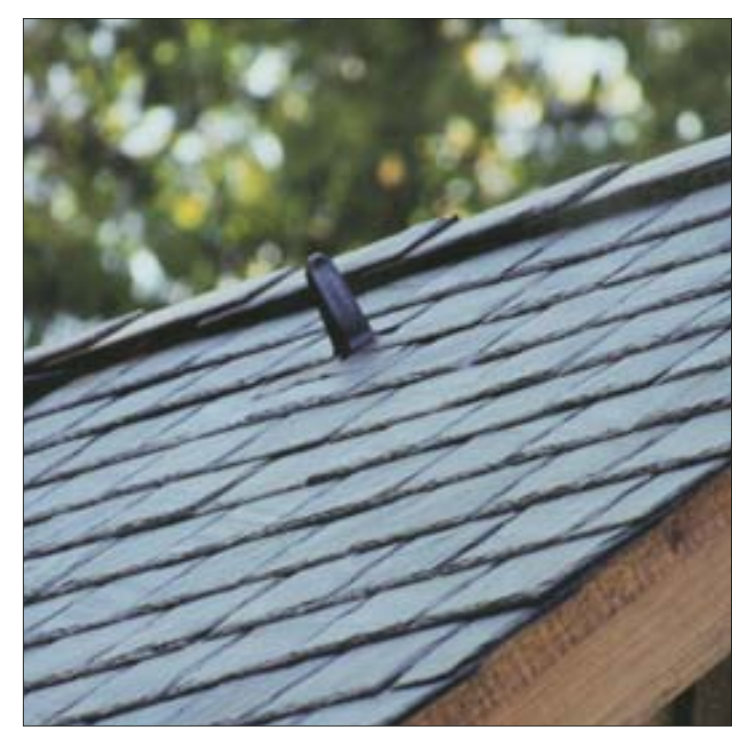
ARS 2x8 blends nicely with a slate roof using a lead based flashing. Shown with black stem cover. Gray and Terra-Cotta covers are also available.