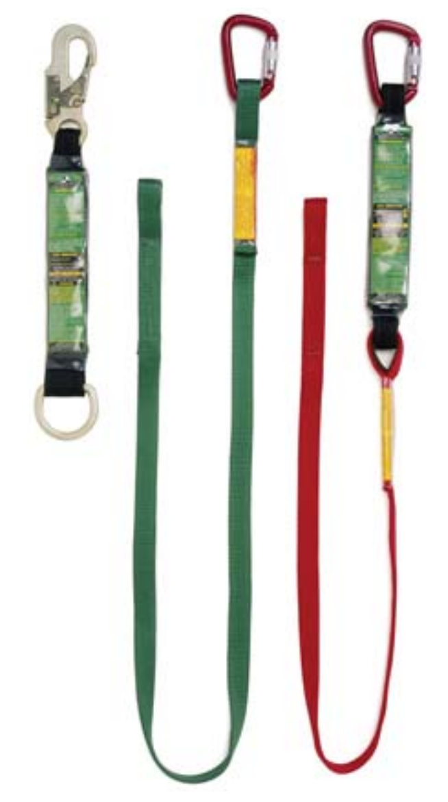
Fall Arrestor® Lanyards with Carabiners Specification Guide