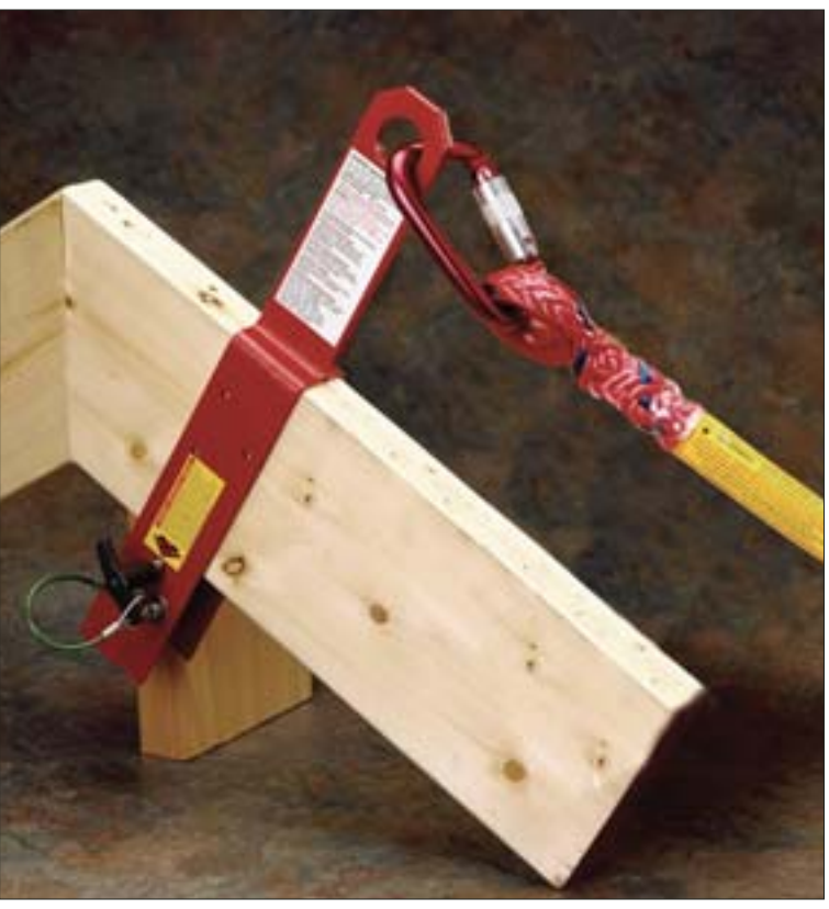
ARS Moveable Anchor shown on 2x6 top chord.