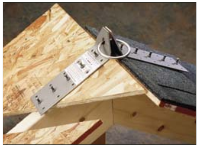
Installs quickly with our #2012 duplex nail fastener package, making it just as easy to remove.