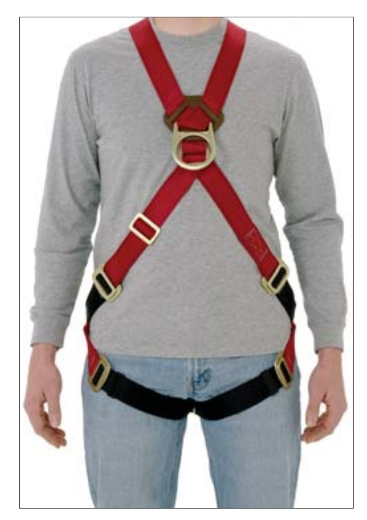
Our #6035 Full Body Harness showing front D-ring placement.