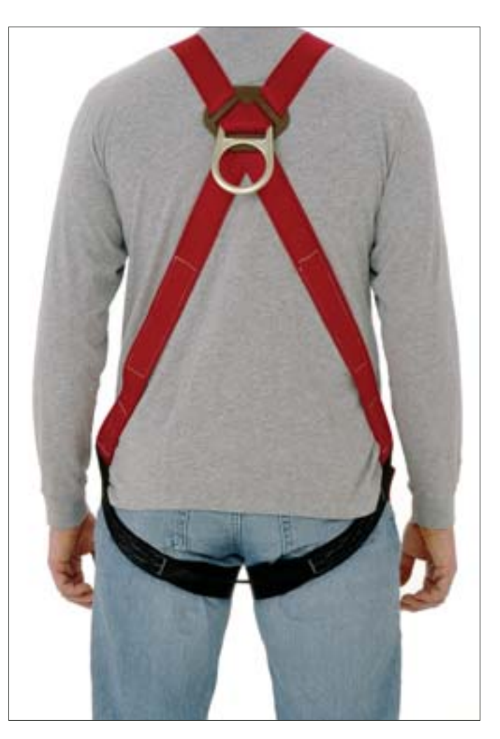
Our #6035 full body harness showing rear D-ring placement.