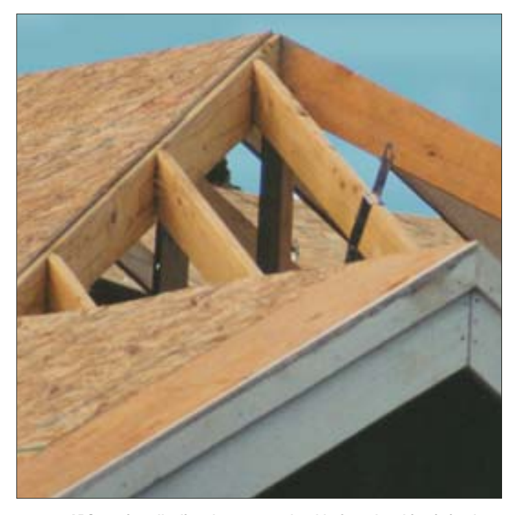
ARS 2x8 installs directly over top chord before sheathing is in place.