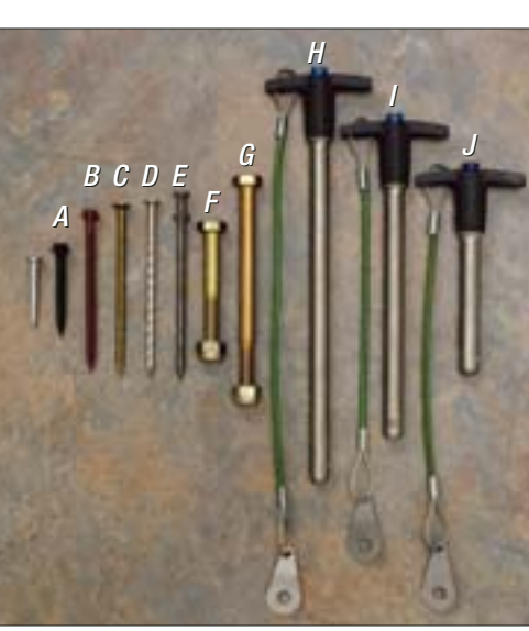
From left to right: A = #2011, B = #2009, C = #2014/2014-A, D = #2013/2013-A, E = #2012, F = #2006/2014, G = #2014-A, H = #2017, I = #2016, J = #2015.

All attachment bolts are supplied in grade 8 die-chromate finishes. Hex head screws and attachment bolts used to secure our anchors are the critical link between performance and failure. Original and replacement fasteners are carefully specified and tested to meet the strength requirements needed to hold up under the extreme forces generated by a free fall. Do not substitute with untested replacements.