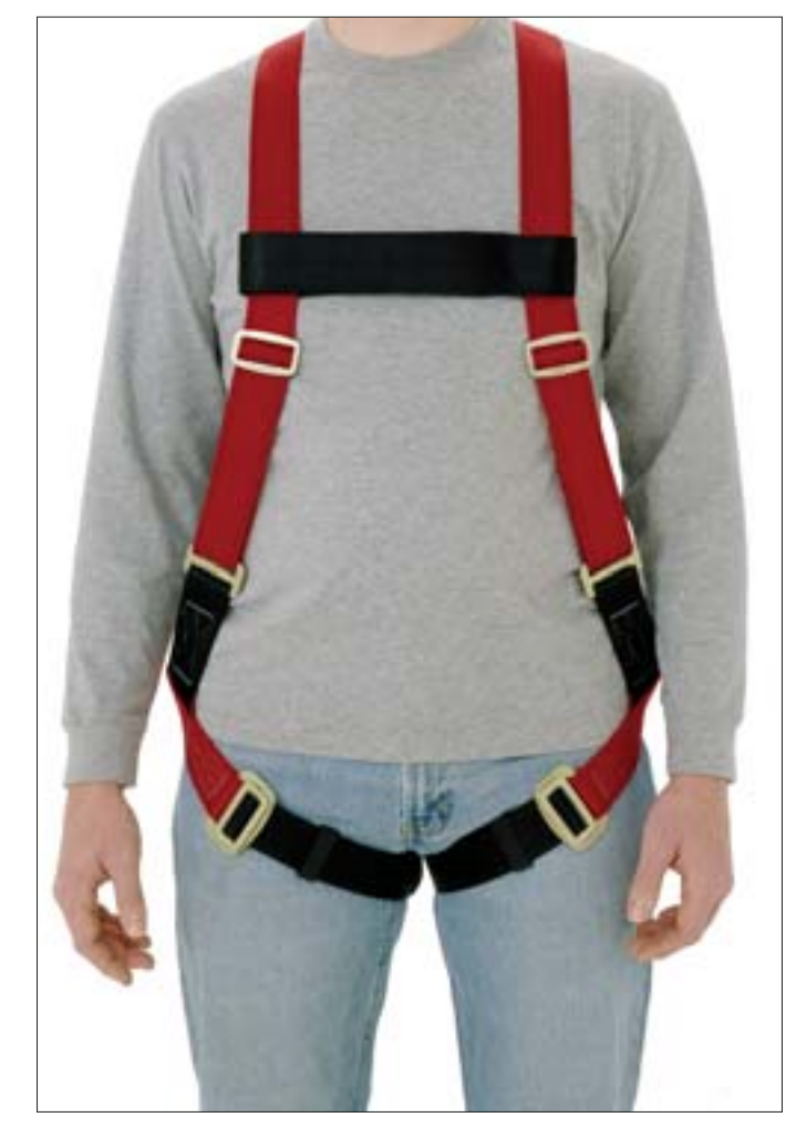
Our #6008 full body harness with a hook and loop chest strap.

The Fall Arrestor full body harness eliminates these annoyances by using a more streamlined design that takes up the excess webbing in the adjustment. We applied the same principle to our buckle-free hook and loop chest strap, a design that has been around for over 20 years. Ask anyone who has ever worn a Fall Arrestor harness, and they will tell you it's the most comfortable and easy to adjust harness that they have ever used. Available in Small, Large and X –large, our harness are pre-adjusted at the factory so they fit right out of the bag. And we offer a custom fabrication for those who require smaller or larger sizes.