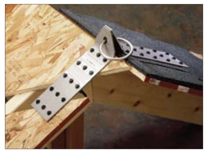
Using fastener package #2011, the Universal can be installed directly to the sheathing or over existing roofing without attaching to a top chord.