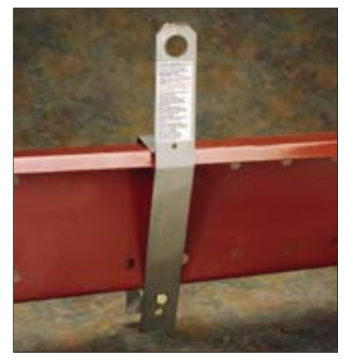
The Super Z-Purlin fits 8"x2.5" up to 9.5"x2.75" Purlins.

The anchor is engineered to fit all common size Z-Purlins, with custom sizes available upon request. Fabricated using 14 gauge stainless steel, our Super Z-Purlin anchor can be installed onto a purlin before or after erecting and will provide a safe tie-off during the construction period. But the real benefits are realized by workers who have to perform service or maintenance. Few surfaces are as dangerous as a high rib metal roof panel when it is icy, wet, or has an accumulation of algae. A cost effective solution to one of the industries most dangerous hazards. Supplied without caulking or flashing fasteners.