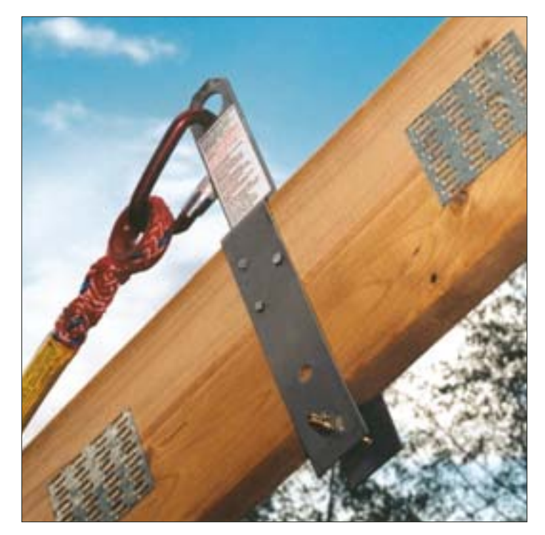
ARS 2x8 is easily installed onto a 2x4 top chord at the truss factory by using a single attachment bolt under the 2x4 blocking.