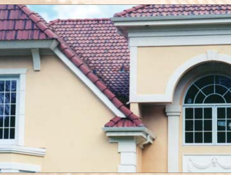
Can you find the anchor? Our tile roof anchors blend into the architecture so seamlessly they are hard to detect!

And there's more! Drawing on our 25 years of tile and slate roofing experience, the ARS Tile Roof instruction manual includes a special 10 page flashing specification guide illustrating several practical ways to solve high and low profile roof tile penetration problems.