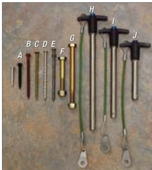
From left to right: A = #2011, B = #2009, C = #2014/2014-A, D = #2013/2013-A, E = #2012, F = #2006/2014, G = #2014-A, H = #2017, I = #2016, J = #2015.

Do not substitute with untested replacements.