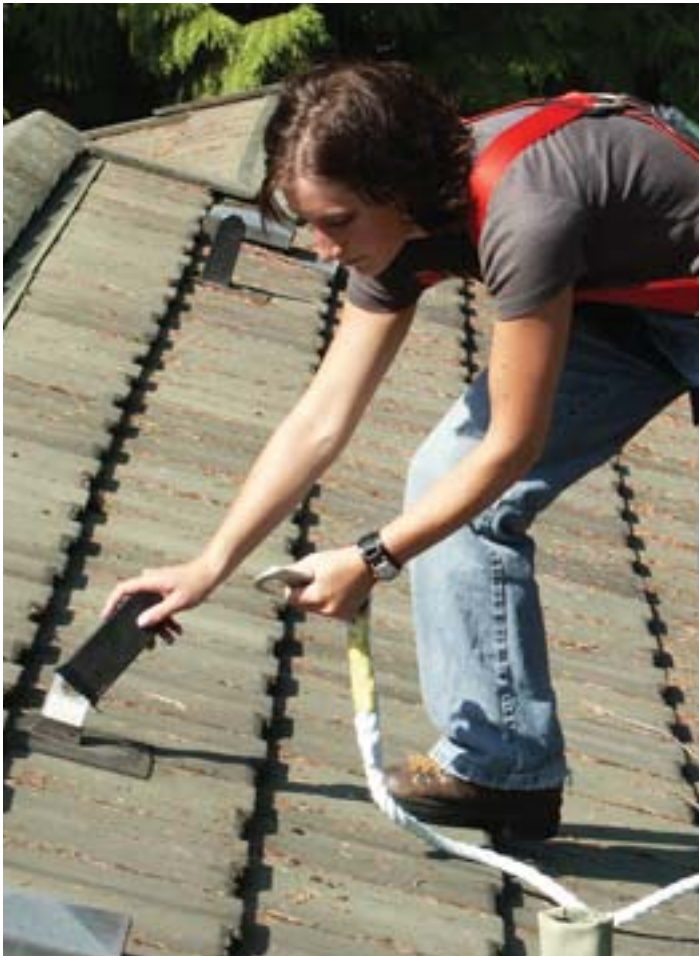
▲ Our Full Body Harness comes in a variety of sizes and fit both men and women. As seen here, safety is literally just a snap away with a properly installed anchor and our Value-Pak Harness/Lifeline System .