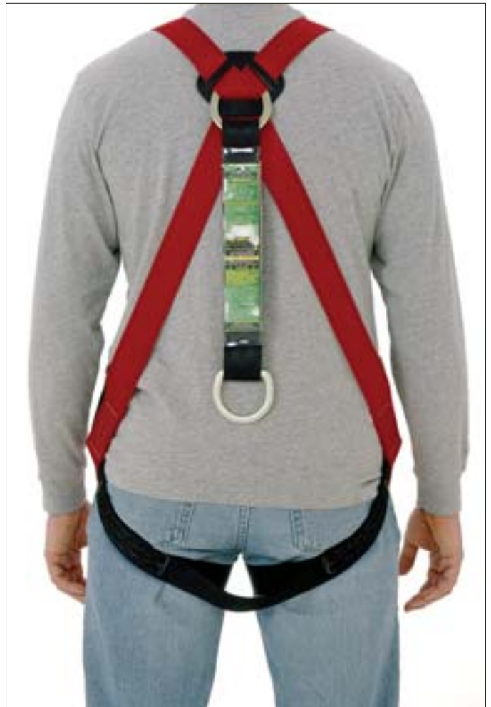
Our #6008 full body harness with integral shock absorber.