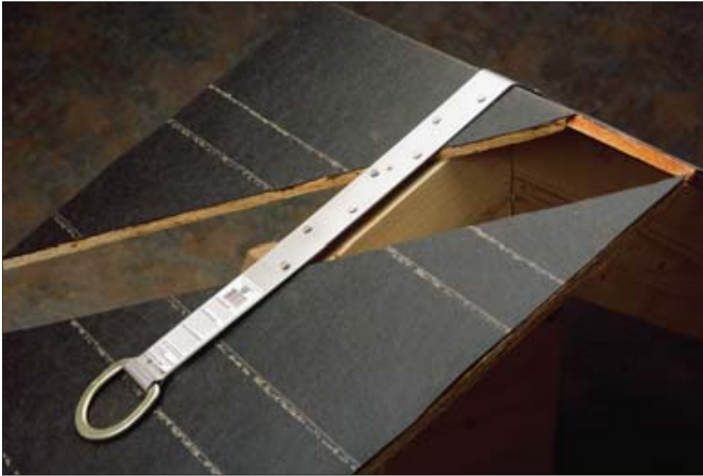
Anchor is centered over top chord through roof sheathing.