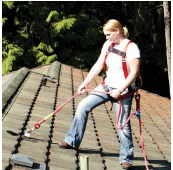
Total Package Deluxe utilizes a 12 strand colored lifeline.