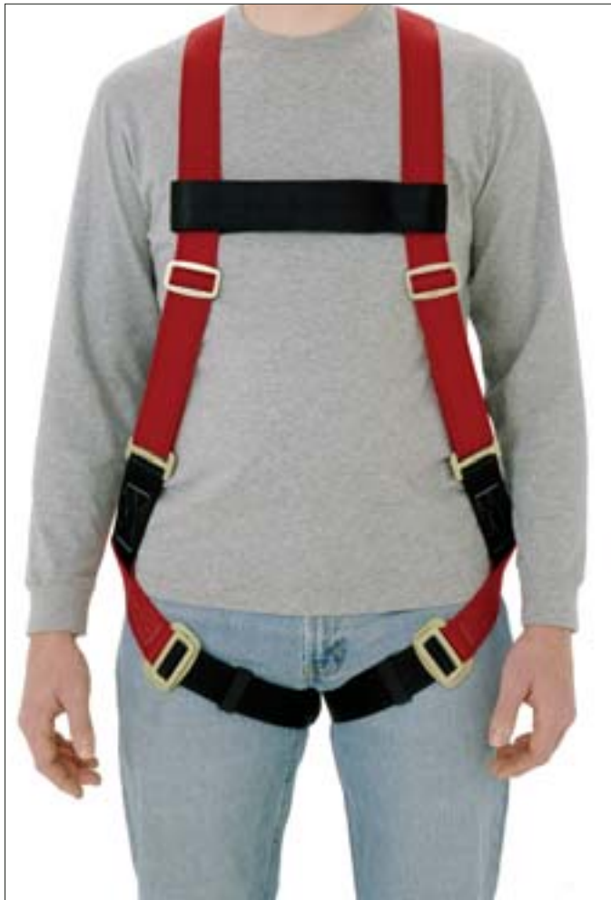
Our #6008 full body harness with a hook and loop chest strap.

The Fall Arrestor full body harness eliminates these annoyances by using a more streamlined design that takes up the excess webbing in the adjustment. We applied the same principle to our buckle-free hook and loop chest strap, a design that has been around for over 20 years. Ask anyone who has ever worn a Fall Arrestor harness, and they will tell you it's the most comfortable and easy to adjust harness that they have ever used. Available in Small, Large and X-large, our harness are pre-adjusted at the factory so they fit right out of the bag. And we offer a custom fabrication for those who require smaller or larger sizes.