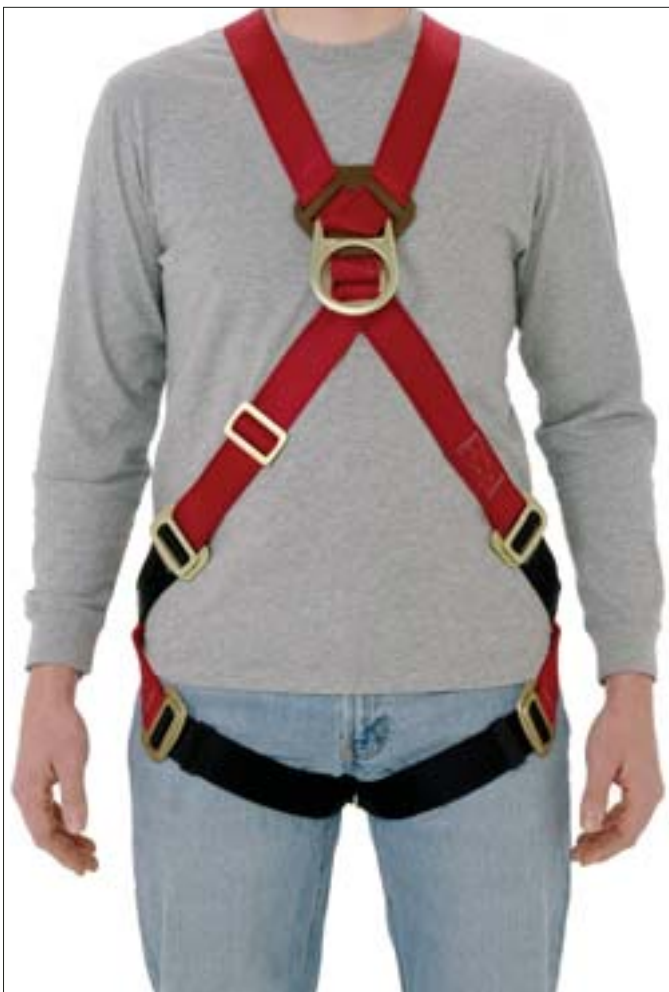
Our #6035 Full Body Harness showing front D-ring placement.