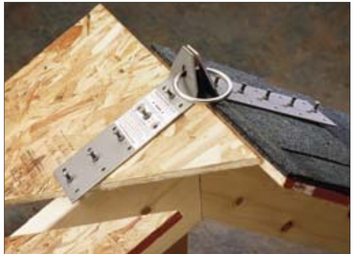
Installs quickly with our #2012 duplex nail fastener package, making it just as easy to remove.