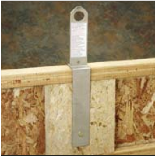
I-joist anchor attached to a top flange using a factory supplied bolt drilled through the web. Furring is required on both sides of the I-joist.