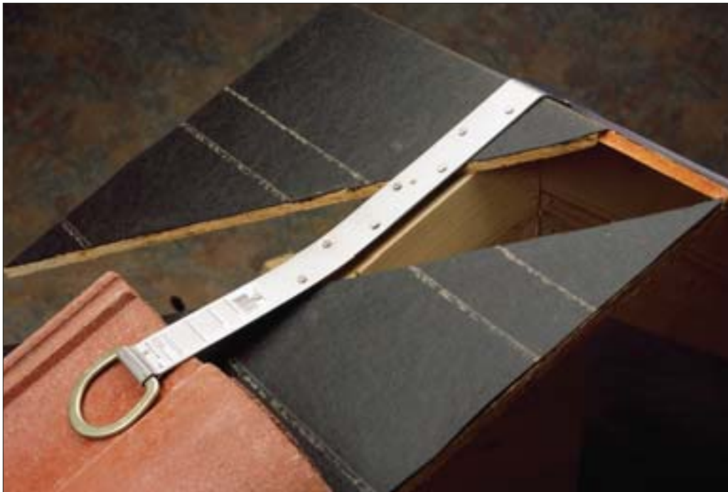
Installed over the ridge and on top of the tile head-lap.