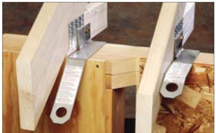
On the left, #1004-A 45° is attached to a 2x6 top plate. On the right, #1004 is attached to a 2x4 top plate shown above low pitched roof.

Siding and related external wall construction, such as window installation and painting, expose workers to an even greater risk than working on elevated surfaces such as the roof. Falls from scaffolding and especially ladders, accounts for more serious injuries than any other job site hazard. Vertical Wall Anchors provide an easy cost effective way to provide protection that can be left in place or removed from service. The low visibility anchor stem comes in two standard configurations allowing a wide range of installation options. Attaches by drilling through the top chord and securing to the wall plate using 4 16d sinkers. The anchor is supplied with all necessary fasteners. Designed to accommodate the bird blocking component on low or steep slopes and fabricated using 1/8" thick stainless steel.