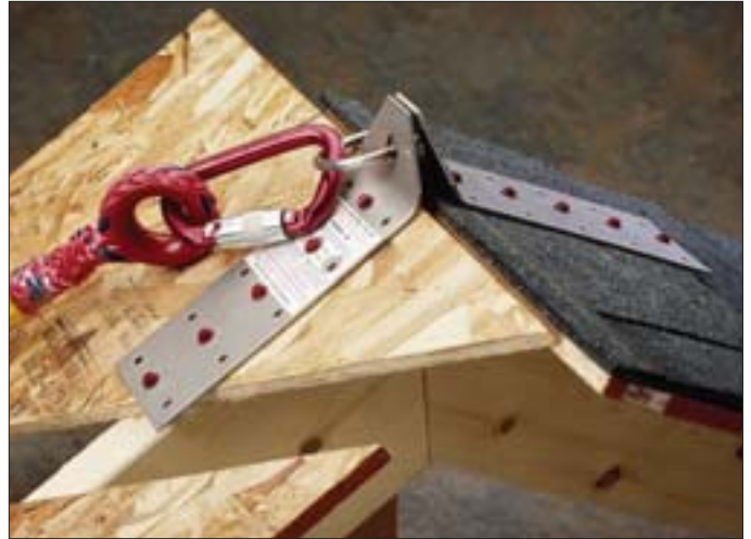
The attachment ring is sized to fit all common size snaphooks and carabiners.